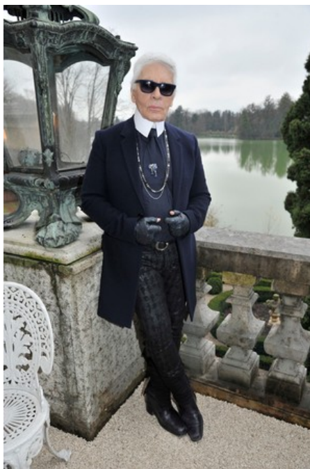
Karl Lagerfeld